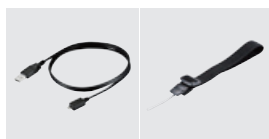
USB Cable Wrist Strap