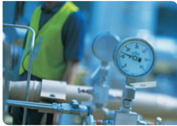
Field Force Automation